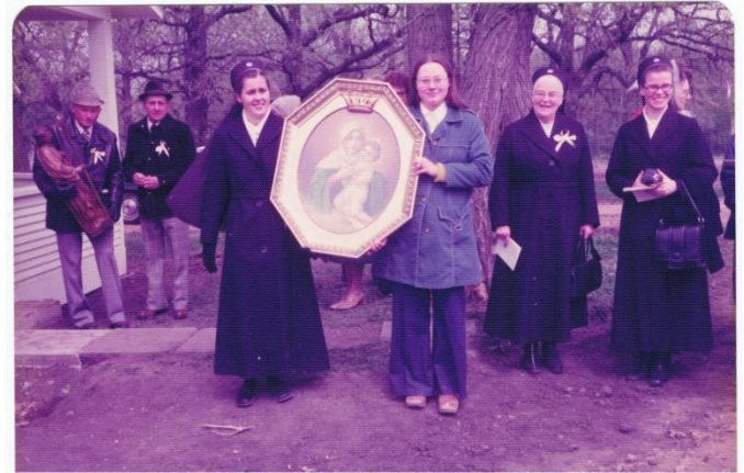
Photo of Shrine Groundbreaking on May 2, 1976

over 60 girls groups, four Father/Son weekends; 15 mothers groups and 20 couples groups, our monthly Schoenstatt weekends are quickly filled.