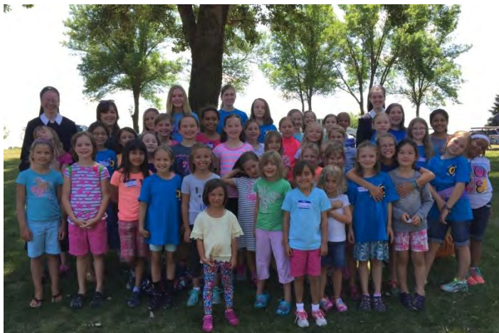
DAY CAMP 2017 brought many hearts to the shrine. There will be a full camp report in the next issue. ☺

Please Mark these COMING EVENTS AT THE SHRINE: