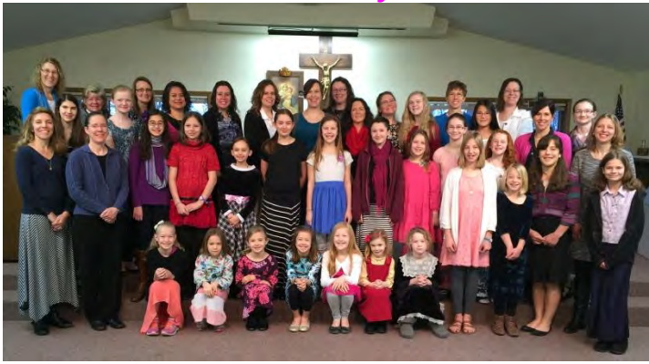
The beloved Mother Daughter Weekend this spring was during Lent from March 31–April 2, 2017, at Sleepy Eye MN.