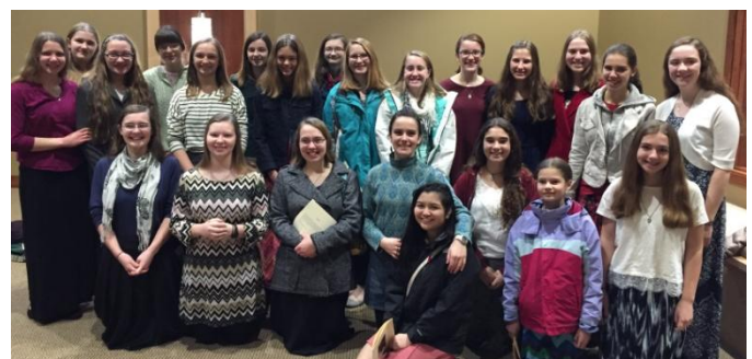
MN Girls at Dec 3rd Reception Rite in WI.