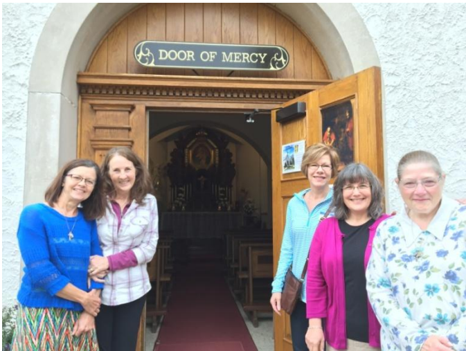
A group from Easton and Wells came for Mercy Retreat + adoration

It was wonderful to welcome hundreds of people to our DOOR OF MERCY on the shores of Lake Sleepy Eye. With the offer of a plenary indulgence for the participant's soul or for a deceased soul, how happy our Mother Thrice Admirable was to welcome all to her pilgrimage place of grace. Was it by chance the smallest Door of Mercy on the planet? Only our MTA knows what all went on in her little throne of grace.