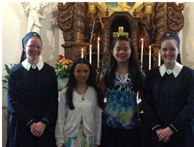
We want to prove first by our deeds that we really love Our MTA. She is the great missionary and she will work miracles of transformation.