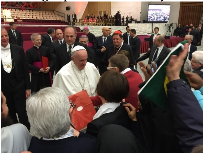
One of the breathtaking moments came as I was walking to the audience, and with heavenly precision, a lead organizer for Secular Institutes came from another door and said “I need two.” We were whisked behind a Swiss Guard to the 3 rd row for a great view and to actually shake hands with Pope Francis!