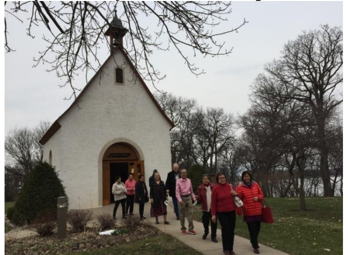
The Filipino Group sponsored the beautiful Black Saturday with the Seven Last Words and prayers, potluck, and stations on March 26. Our MTA admires their faithfulness and deep love for Jesus' Passion.